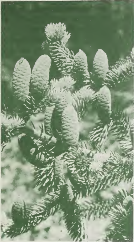
Balsam fir. F-430963 (About one-third natural size)

time are black spruce ( Picea mariana ), which have been painted. They come mostly from the swampy areas of northern Minnesota. The stiff, crowded, somewhat curved needles are 4-angled, short— \frac{1}{4} to \frac{5}{8} inch long, and pale blue green. The twigs are hairy, and the cones are small— \frac{3}{4} to 1\frac{1}{4} inches long, dull gray brown, with rounded, stiff, slightly toothed scales. The bark is grayish brown and thin.